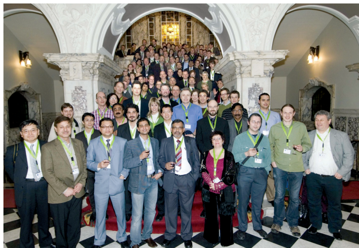
ICSES Conference Dinner at Belfast City Hall, organised by CST Research Group in conjunction with HySAFER and RPP, February 2011.

The four core areas of current activity in FireSERT: fire dynamics and materials, structural fire engineering, fire protection and human behaviour in fire were all significantly advanced over the year. FireSERT continues to attract considerable project funding from EPSRC, government, the European Union and industry. Current externally funded projects are examining building safety related to flashover and façade fires, the assessment and evaluation of fire safe nanoparticle materials including the potential for nano-engineered materials, the replacement of brominated fire retardants (FRs) with environmentally compatible FRs, fire safety of aircraft composite materials, the performance of structures (cellular beams) and elliptic cross section columns in fire situations. New European design rules were developed in a project on the fire resistance of long span cellular beams made of rolled profiles. Collaboration with Bombardier for aircraft fire safety and the assessment of composite material flammability is a major outcome of the research expertise within FireSERT.