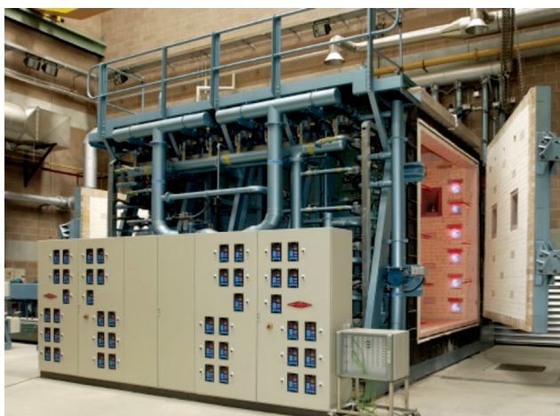
Furnace at FireSERT at the Jordanstown Campus.

In terms of resources, the furnace at FireSERT is unique and can take different restraint effects similar to structural elements designed for real buildings. The furnace can combine axial restraint forces and applied vertical loads on structures subjected to standard temperature fire curves. Infrastructural improvement has seen the furnace at FireSERT extended to accommodate structures of 7.5m span. With this development safe structures will be designed through the research at FireSERT to avoid and eliminate the catastrophic collapse of buildings.