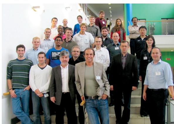
HySAFER group members with participants of 9 th Short Course and Research Workshop on Hydrogen Safety, October 2010.

During the year, the 9 th , 10 th , and 11 th international short courses and advanced research workshops “Progress in Hydrogen Safety” ( http://hysafer.ulster.ac.uk/phs/ ) were organised. HySAFER was also a partner in the ICSES conference hosted in February 2011 with a dedicated track on hydrogen safety and hydrogen storage.