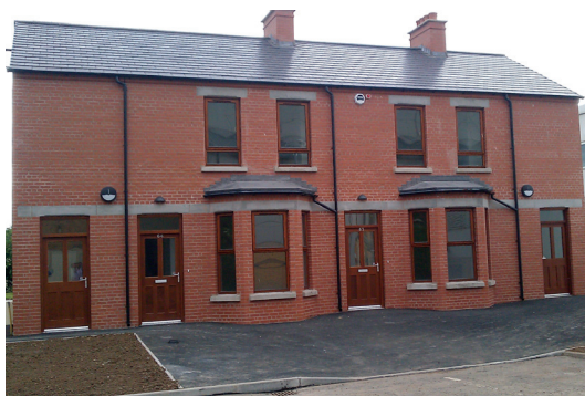
Terrace Street, the experimental houses constructed at the Jordanstown campus by CST and funded under the Research Capital Investment Fund.

Over the year, the Centre for Sustainable Technologies (CST) has seen the enhancement of its test facilities through the construction of Terrace Street, a replica pair of 1900s solid wall properties representative of the 8 million houses of this property type in the UK. These highly instrumented and occupied houses will be utilised to evaluate the techno-socio-economic challenges associated with retrofitting which has been widely advocated as improving the quality and energy efficiency of the UK's housing stock. The research stemming from this investment will influence the effectiveness of low carbon solutions and inform home-owners, landlords, social housing providers, technology providers and policy makers. The development of dedicated biomass facilities incorporating gasification, engine test areas and a suite of sophisticated biomass energy analysis tools will complement the techno-economic analysis for which CST has developed an international reputation.