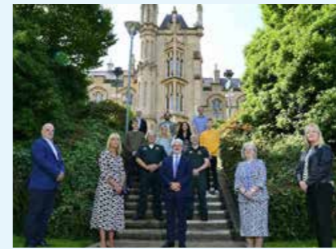
▲ Ulster University welcomes students to the first Paramedic Sciences degree programme in Northern Ireland