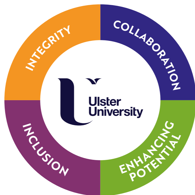
▲ Ulster University's values

At Ulster University, we are open and honest, allowing us to develop professional and positive trusting relationships. We strive to make sound judgements, recognise each other's contribution and understand the impact our actions can have on colleagues and students.