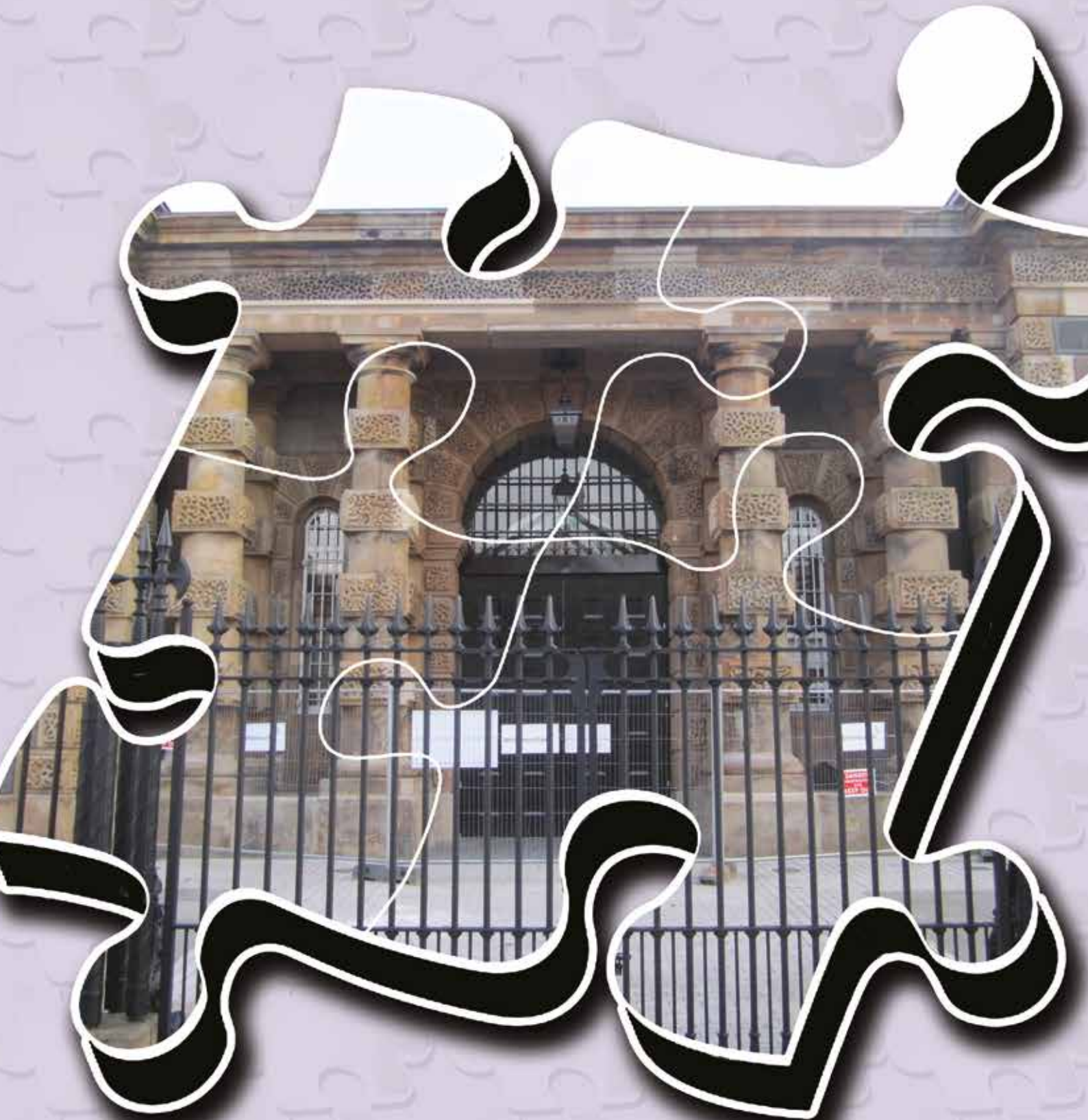
Crumlin Road Gaol, one of Europe's most high profile prisons that was closed in 1996 and which is now a significant tourist attraction.