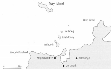
Map of North Donegal