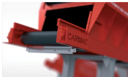
Artwork undertaken for Carmac Waste Handling Systems (WHS) under the Innovation Promoters Programme (IPP)