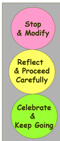
Figure 2 – Coloured Letters

to those achieving more than 85% attendance, yellow to those whose attendance was between 75 and 85%. Pink letters to those whose attendance had dropped below 75% to an unacceptable level. All pink letters also had an appointment to attend a meeting with the first year tutor. Absence interviews were conducted on the basis of trying to identify and resolve issues contributing to the lack of attendance. These activities are indicative of the control aspects of the ‘Triple C Model’ implemented under the principle of assertive outreach.